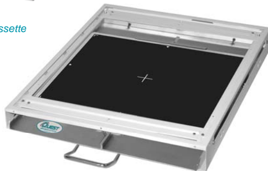
Shown with QUEST Grid Cabinet (Q-1717GC) & CR Cassette