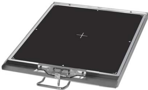
Shown with 17x17 Cassette

FITS ALL TYPES OF PANELS DR & CR - UP TO 17" x 17"